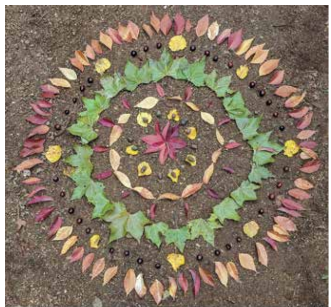
Mandala leaf

So let's all celebrate autumn I say because it's amazing, hip hip hooray.